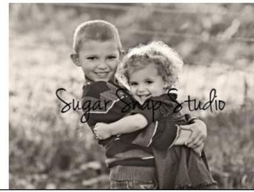
Photo Album Competition: A memorable snap from your family album with your brother/sister and add a wonderful caption to it. These will be presented in class and the best will be judged.